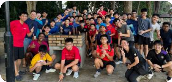
49th Singapore Company during their Fun Camp