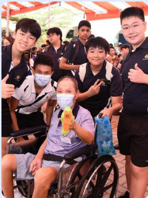
Boys experiencing the carnival with the beneficiaries.

Together, we can fulfil the Object of The Boys' Brigade and serve the evolving needs of our community.