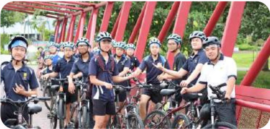
87th Singapore Company cycling during their Adventure Camp

Our Companies also took the lead in strengthening bonds through shared activities. 14th Singapore Company (Anglican High School) hosted an exchange with 40th Singapore Company (Changkat Changi Secondary School), where Boys enjoyed a lively Pipes & Drums session before ending the day with friendly basketball matches.