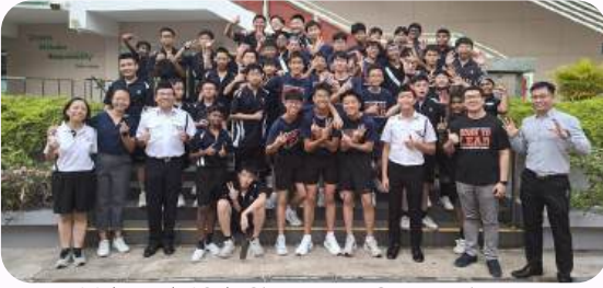
14th and 40th Singapore Companies at their Company exchange